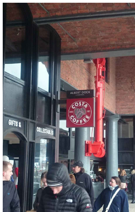
Example of Similar Blade Sign along Colonnades

This drawing is not to be scaled. The contractor is requested to check all dimensions before the work is carried out. Any errors or discrepancies should be reported as soon as they are discovered.