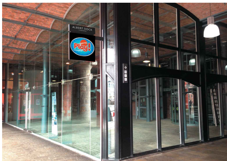
Proposed Blade Signage Visualisation