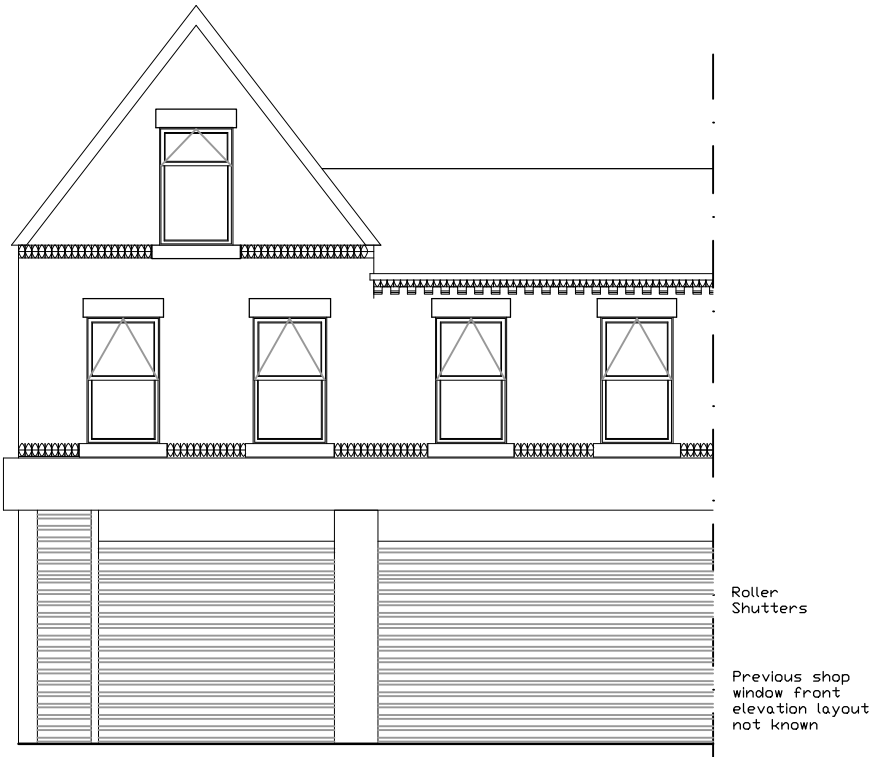
Existing Front Elevation - 1:100