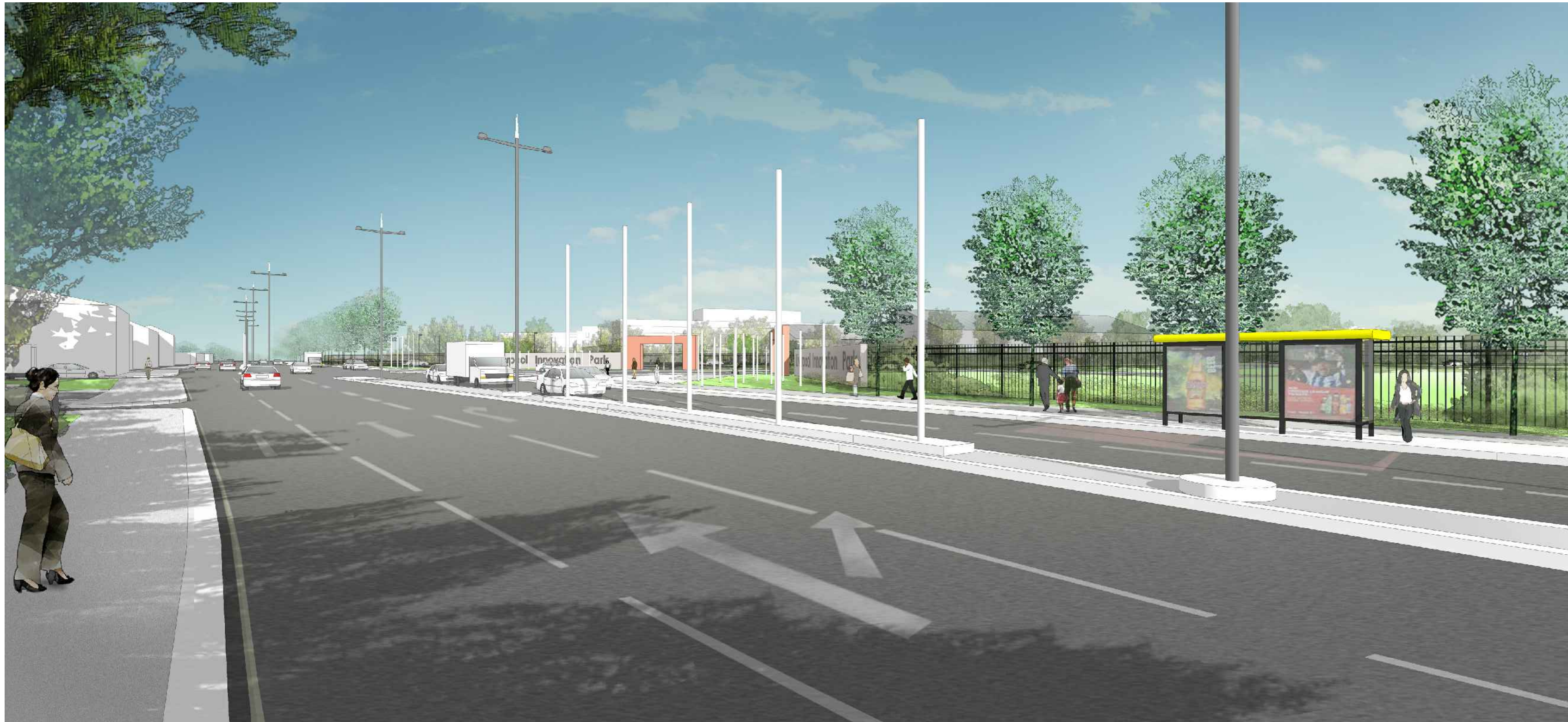
3D-V2 Street View from Edge Lane