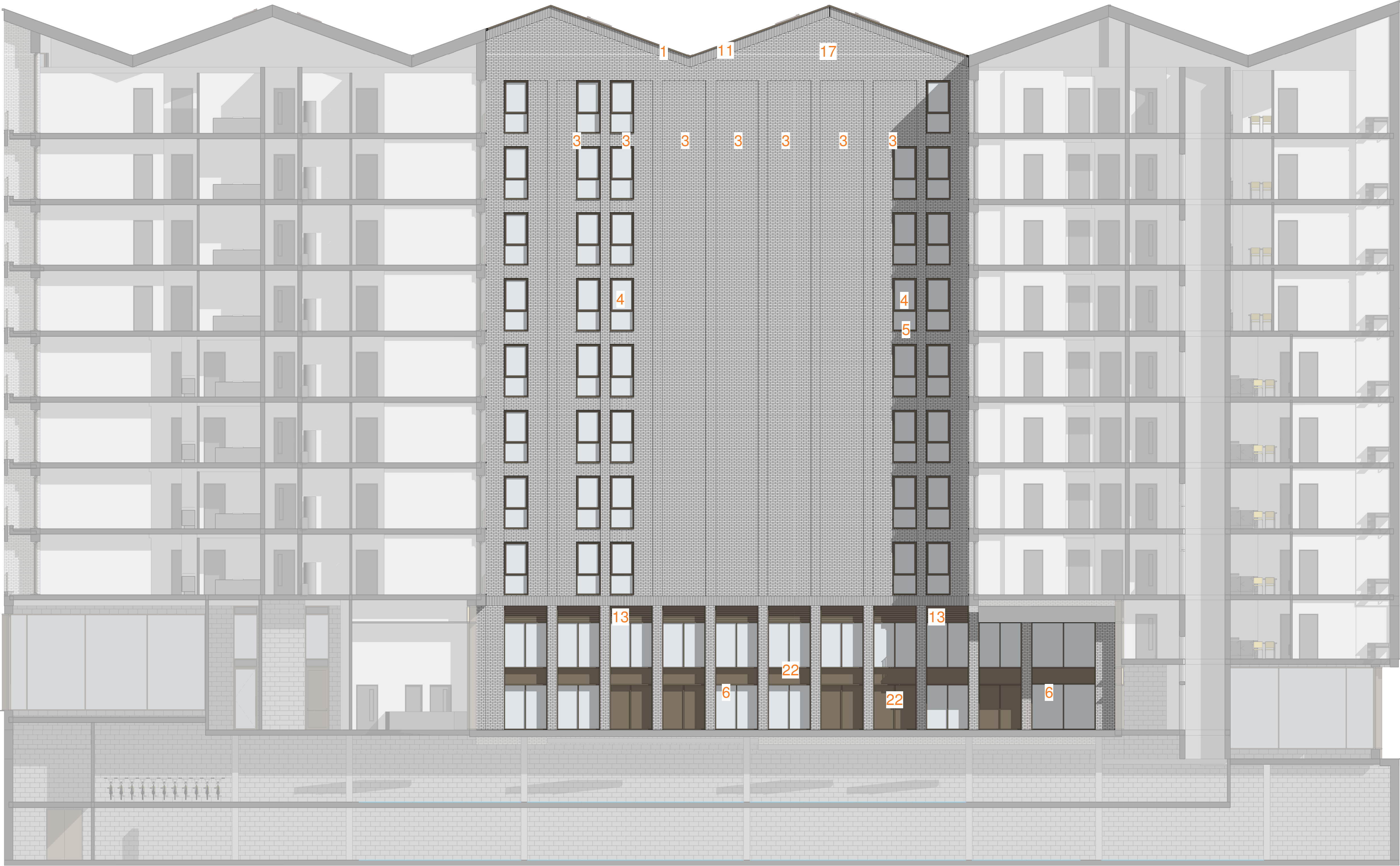
Courtyard Long Elevation 3