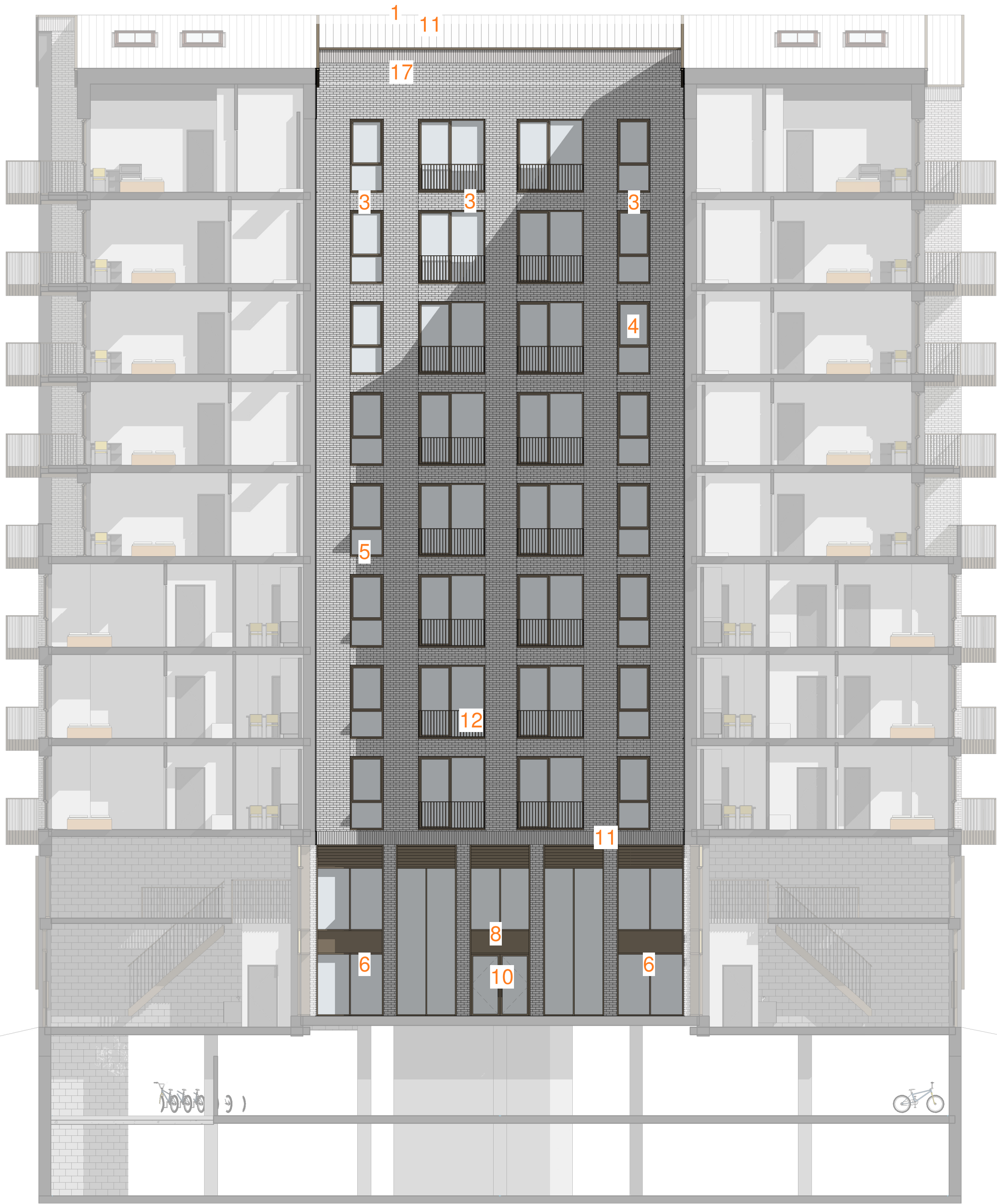
Courtyard Short Elevation 4