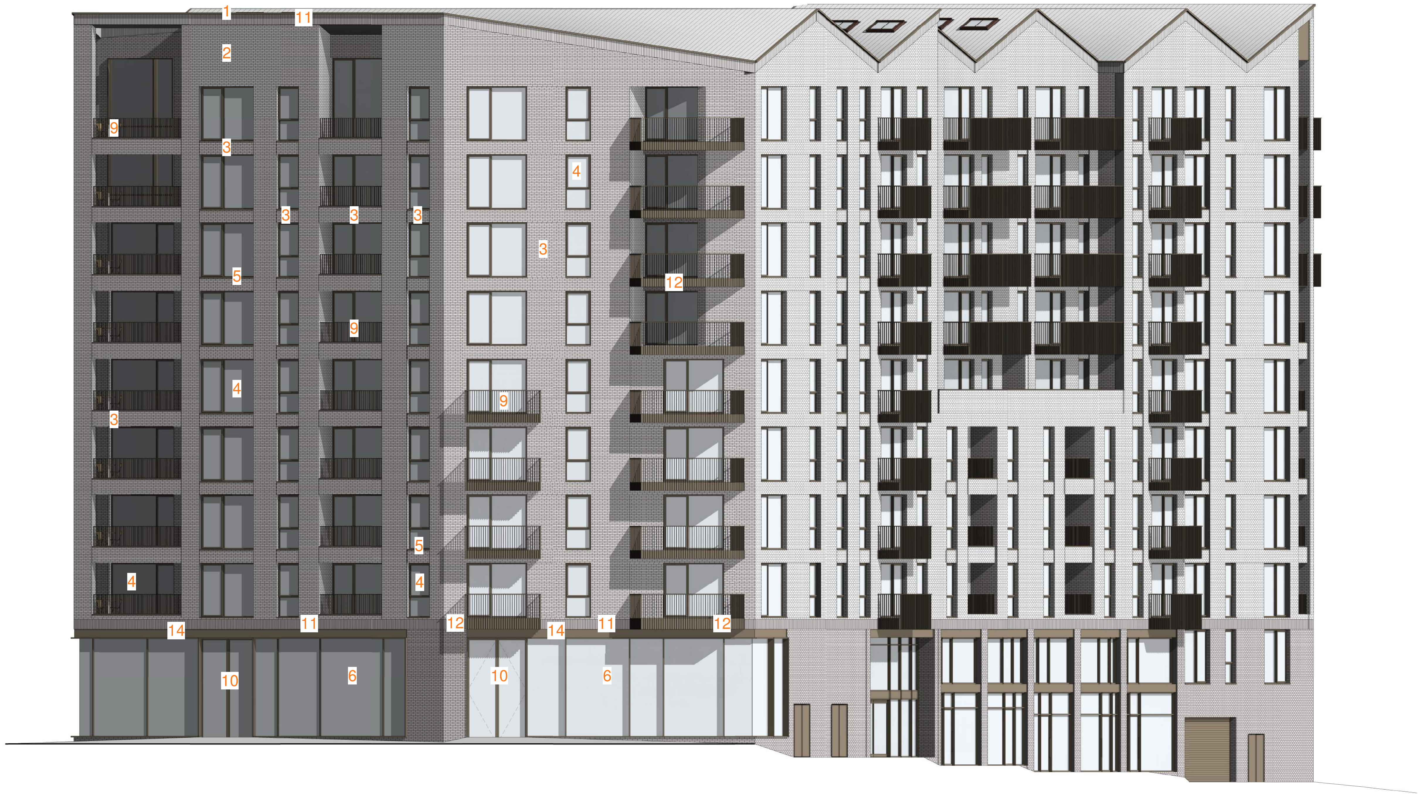
St James Street 1 : 100

*ALL RAL (COLOURS) & MATERIALS TBC BY CLIENT AND APPROVED BY PLANNING