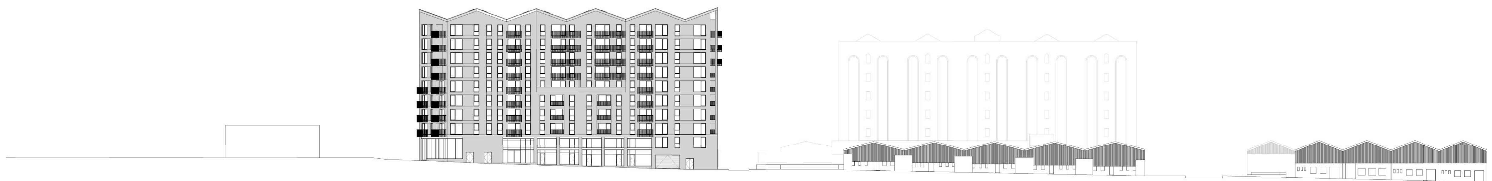
Jordan Street Context ELevations_ GA 1 : 500