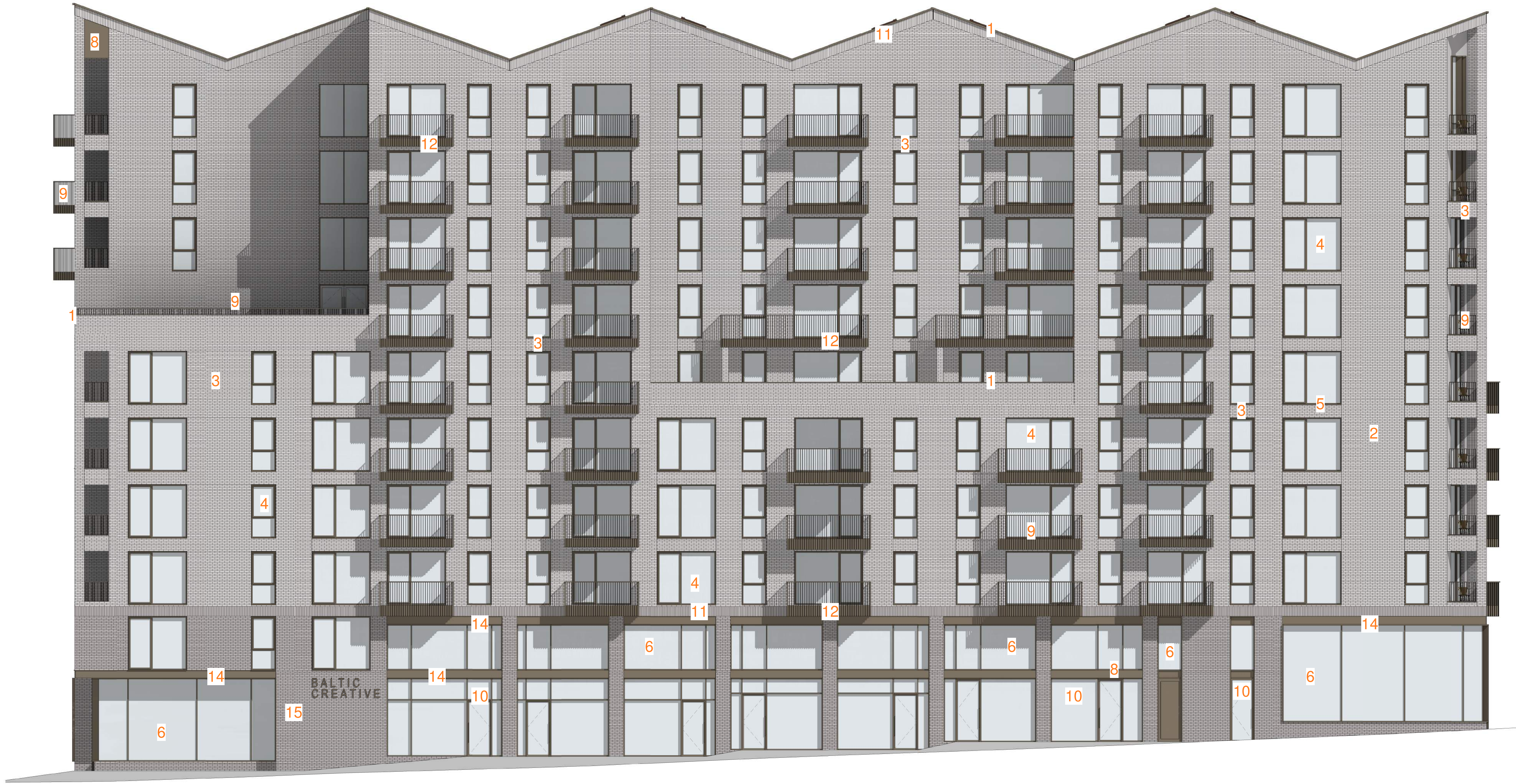
New Bird Street GA 1 : 100