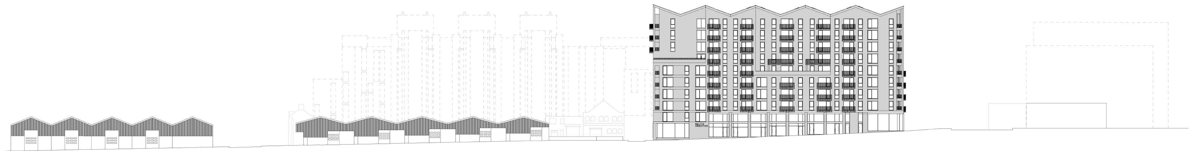
New Bird Street Context Elevations_GA 1 : 500