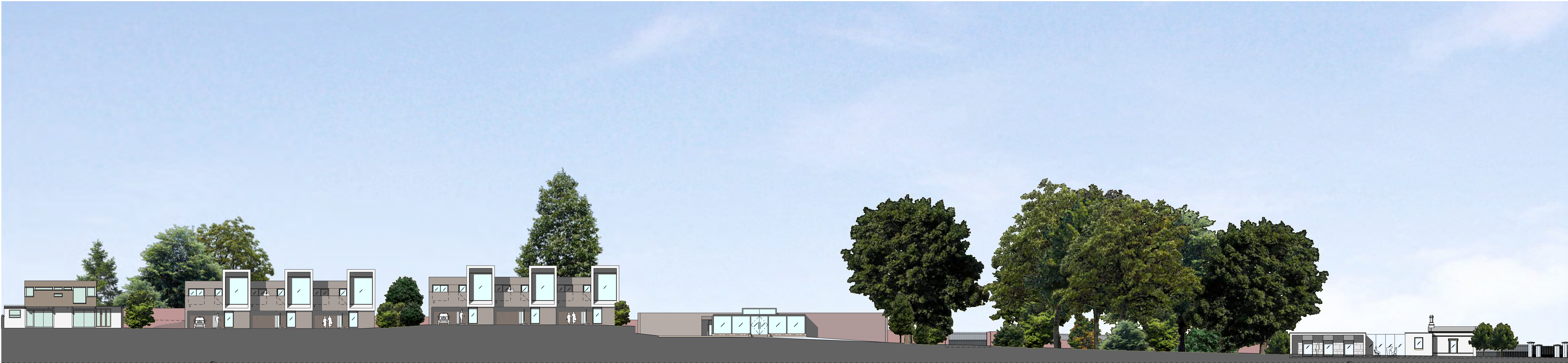
CEDARWOOD ATTACHED VILLAS ATTACHED VILLAS BESPOKE ORANGERY HOUSE BESPOKE GREEK LODGE HOUSE LISTED GATES Proposed Sectional Elevation line FF (1:250) KNOLLE PARK SITE EXTENTS