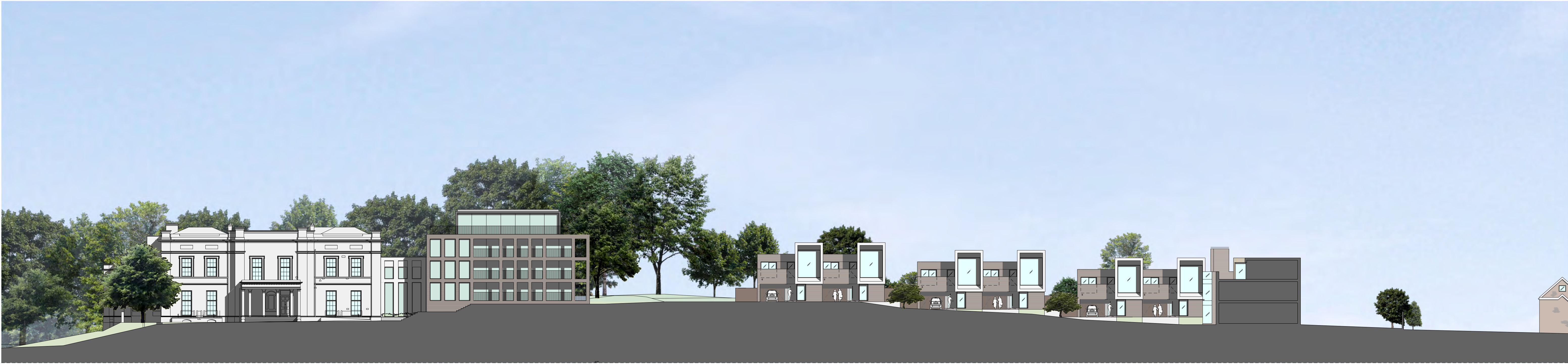
KNOLLE HOUSE NEW LINK NEW APARTMENTS ATTACHED VILLAS ATTACHED VILLAS ATTACHED VILLAS DETACHED HOUSE HOUSE AND GARDEN ON BARONCROFT ROAD Proposed Sectional Elevation line EE (1:250) KNOLLE PARK SITE EXTENTS