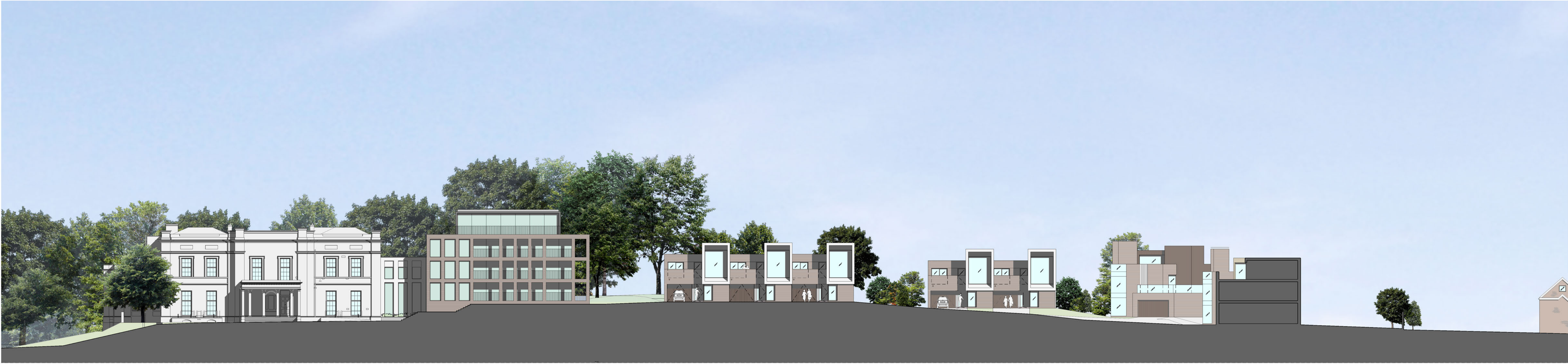
KNOLLE HOUSE NEW LINK NEW APARTMENTS ATTACHED VILLAS ATTACHED VILLAS DETACHED HOUSE DETACHED HOUSE HOUSE AND GARDEN ON BARONCROFT ROAD KNOLLE PARK SITE EXTENTS