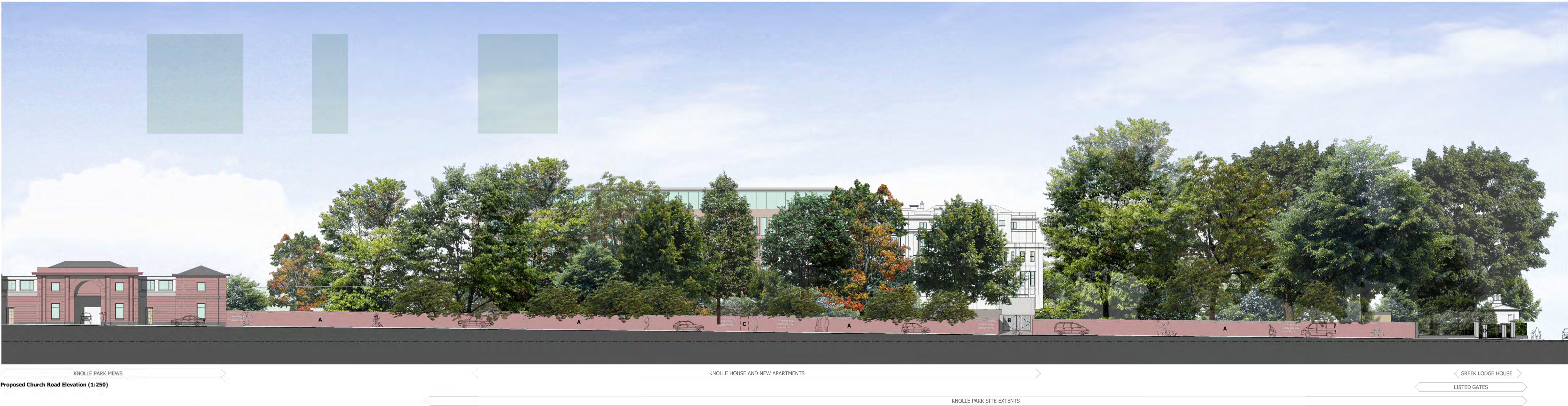
Proposed Church Road Elevation (1:250)