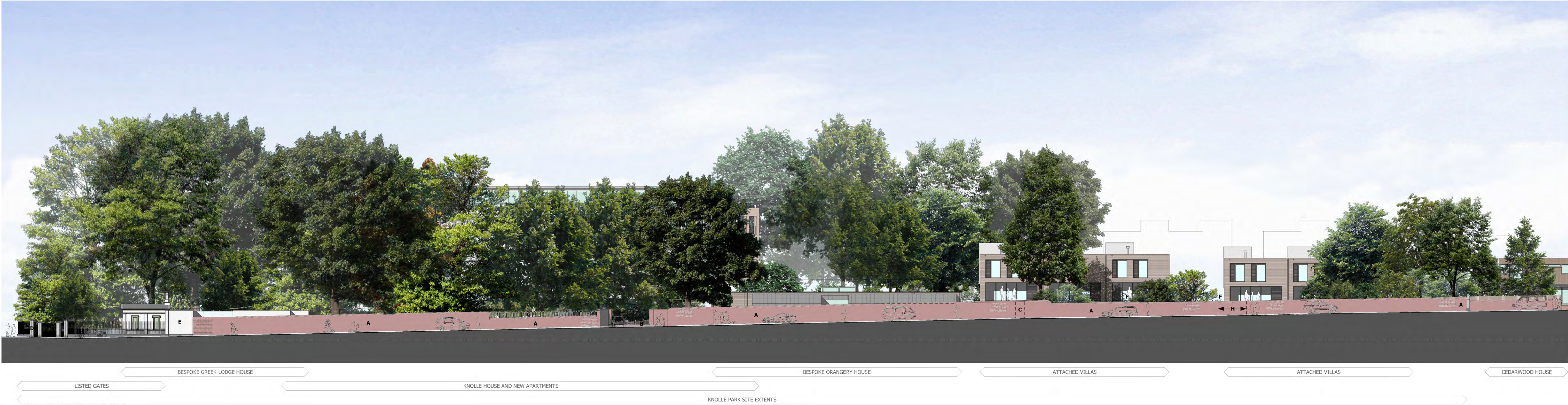
Proposed Beaconsfield Road Elevation (1:250)