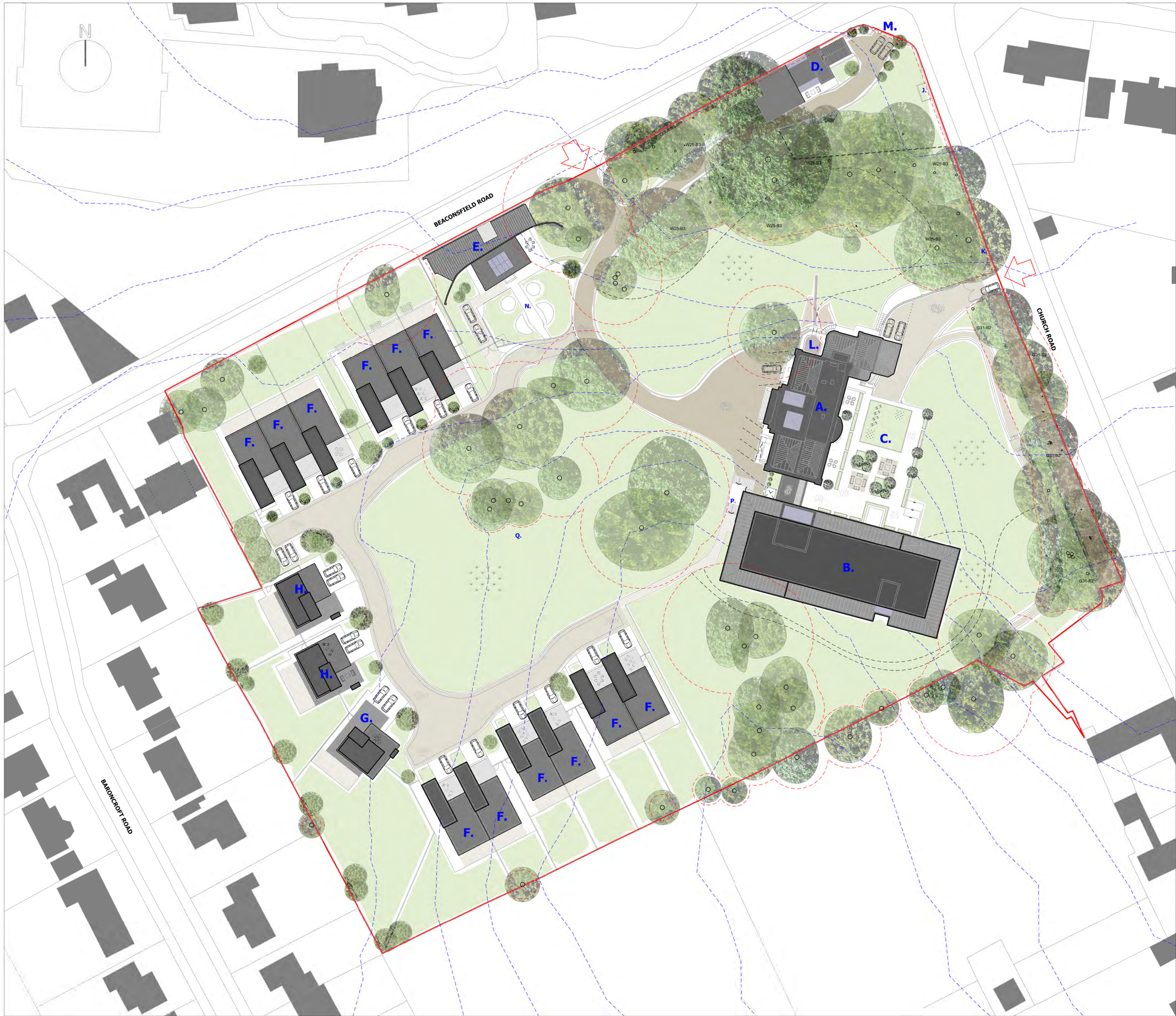
Existing Site Plan (1:500)