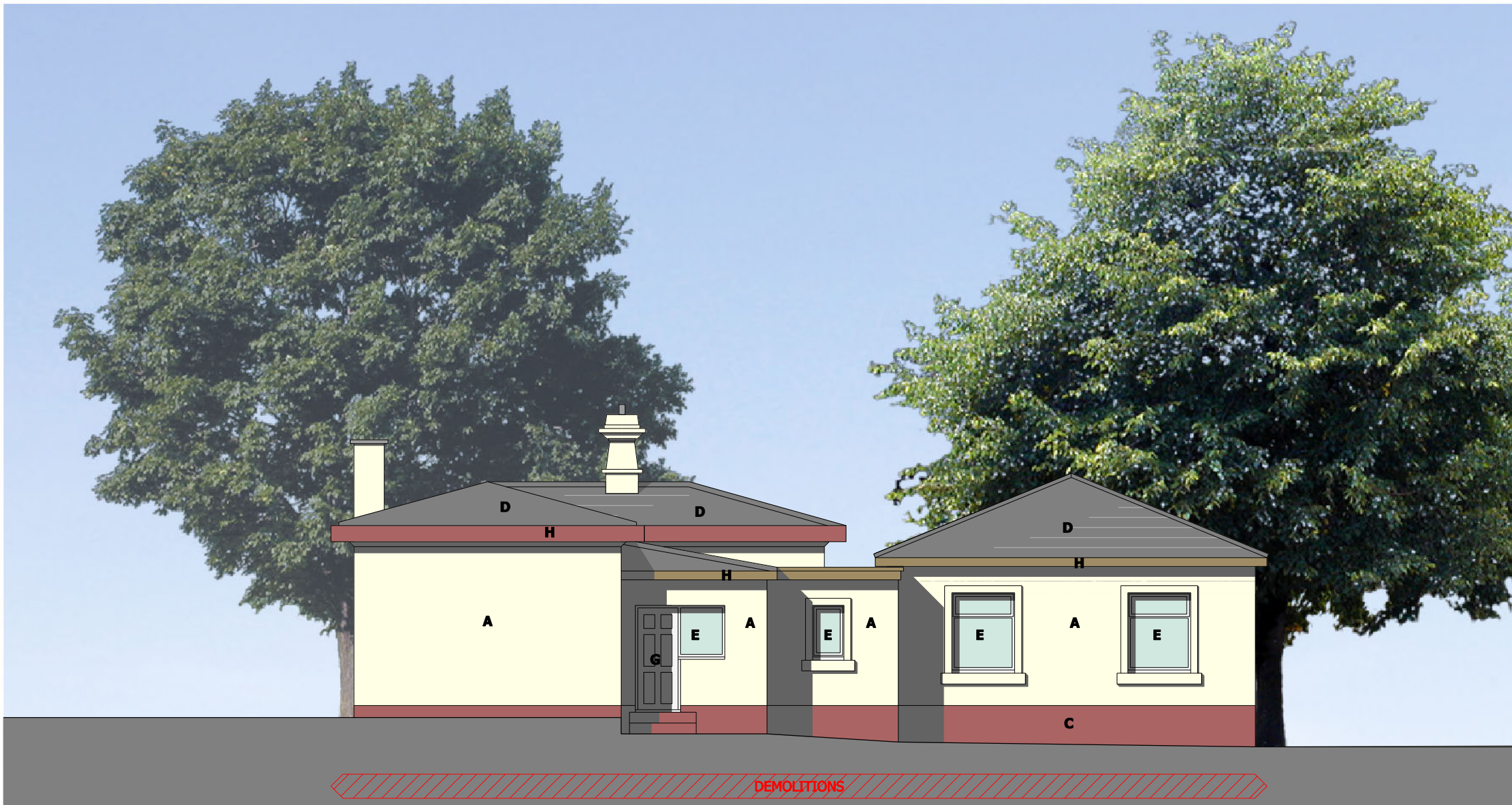
Existing Elevation SE (1:100)

Gardeners cottage, extensions and garage demolished