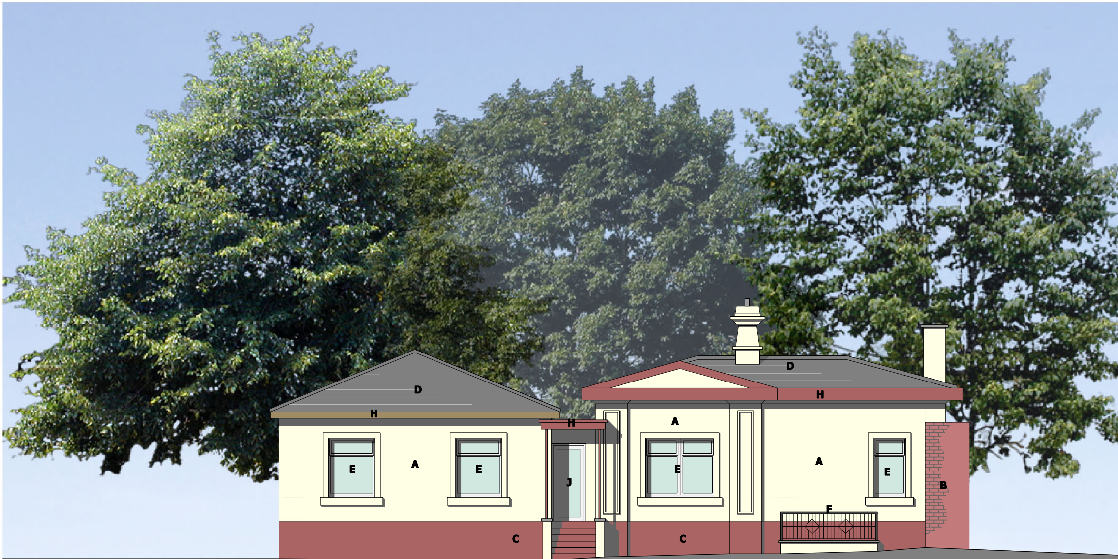
Existing Elevation NW (1:100)

Gardeners cottage, extensions and garage demolished