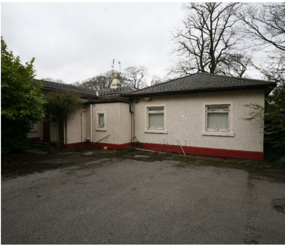
Photographs of existing Gardeners Cottage