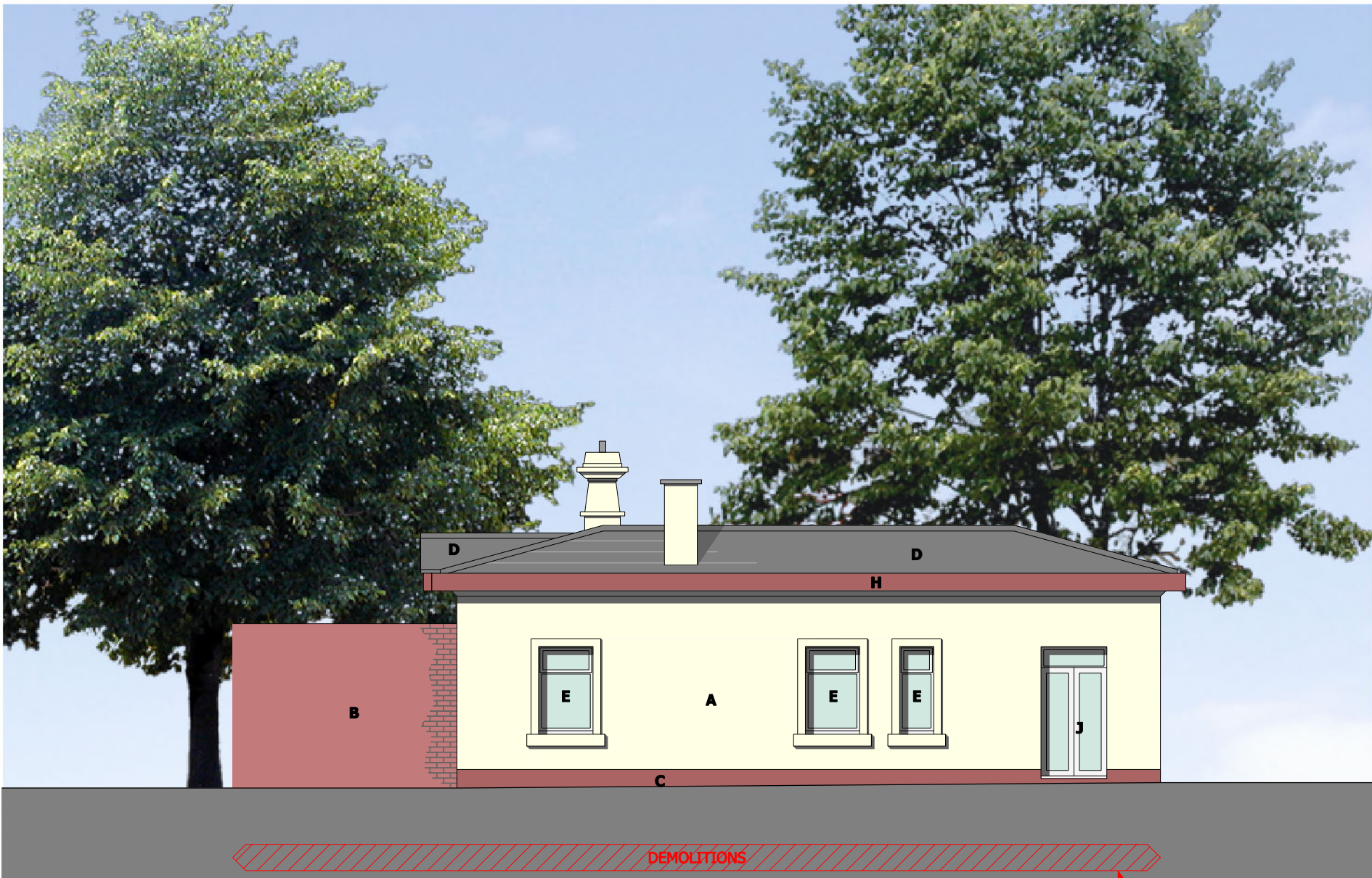
Existing Elevation SW (1:100)

Gardeners cottage, extensions and garage demolished