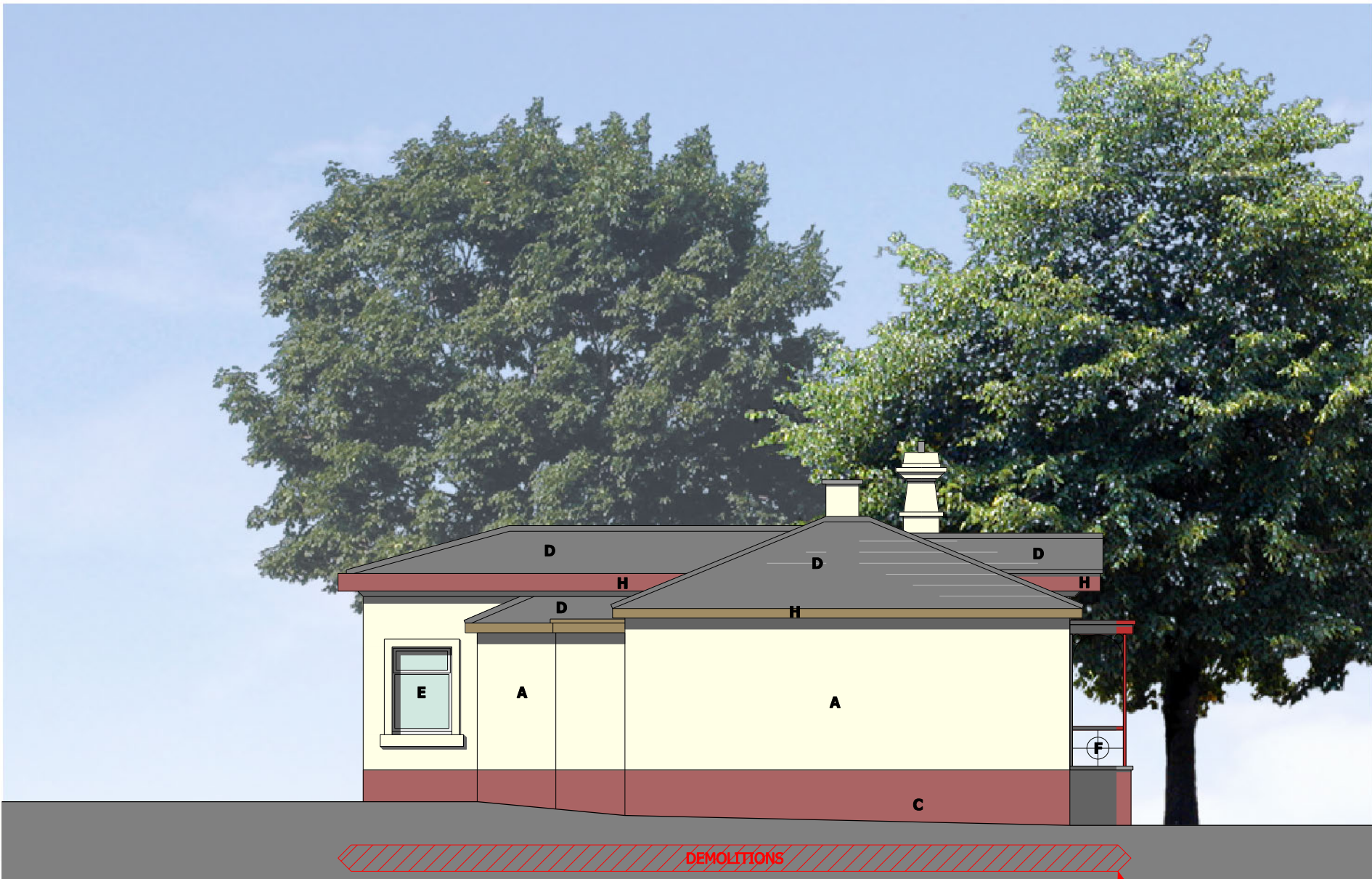
Existing Elevation NE (1:100)

Gardeners cottage, extensions and garage demolished