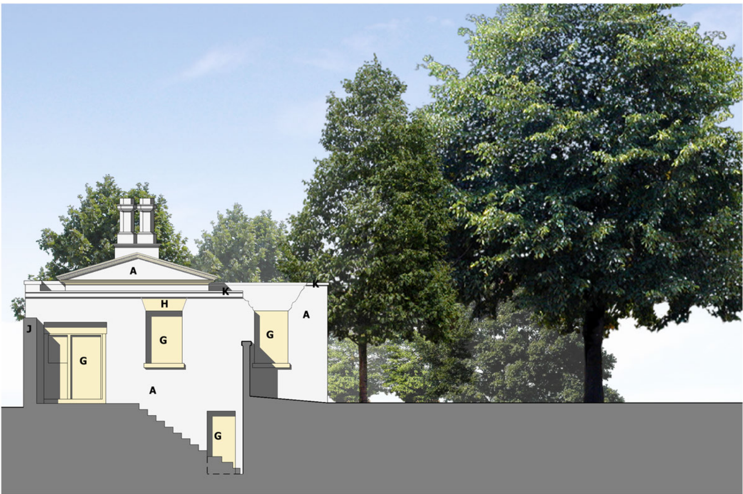
Existing Elevation SW (1:100)