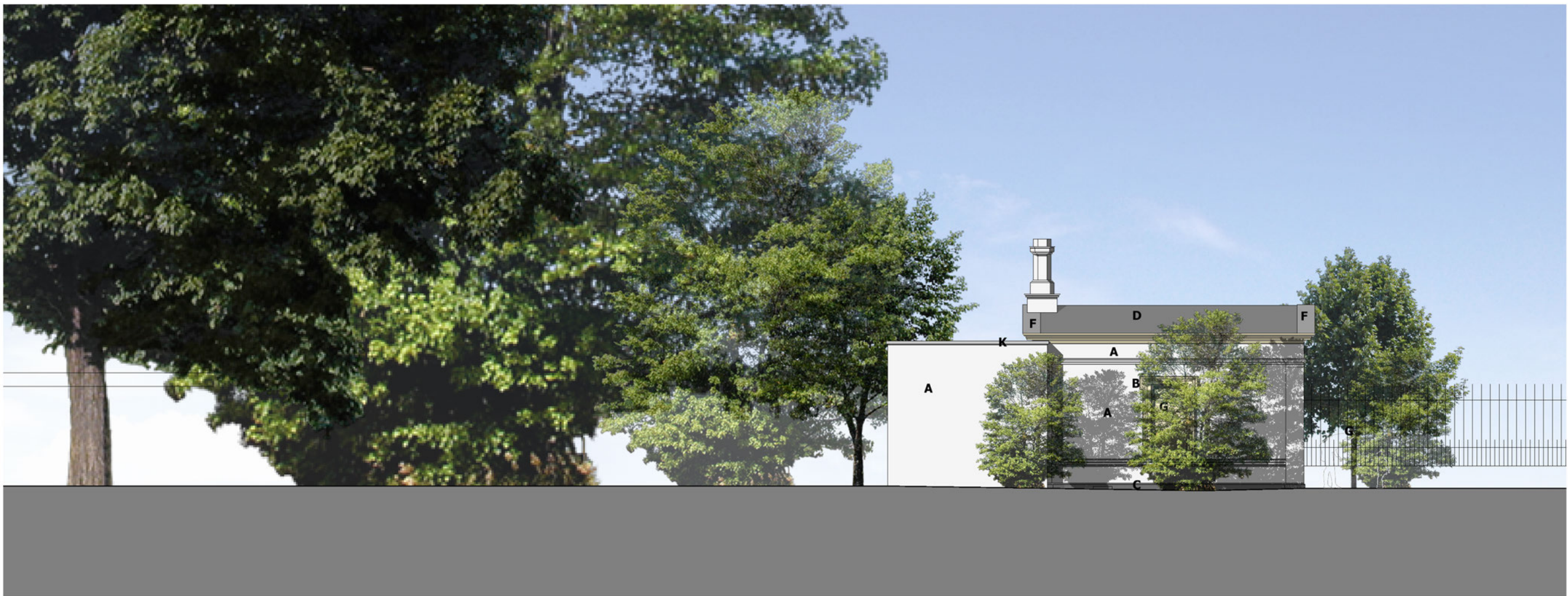
Existing Elevation SE (1:100)