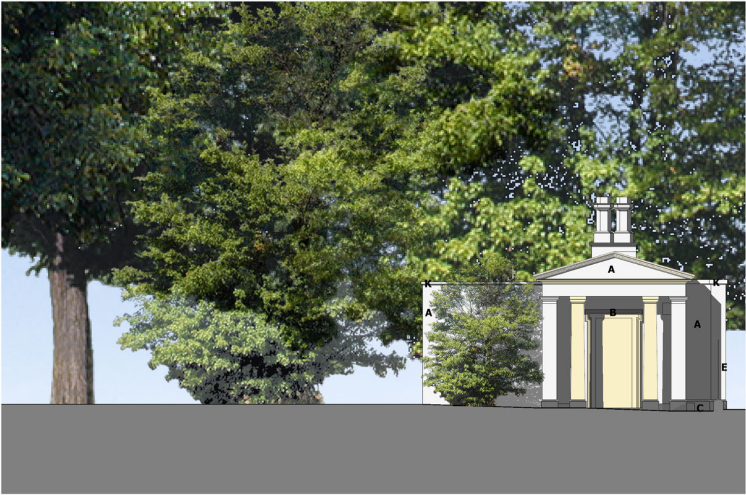
Existing Elevation NE (1:100)