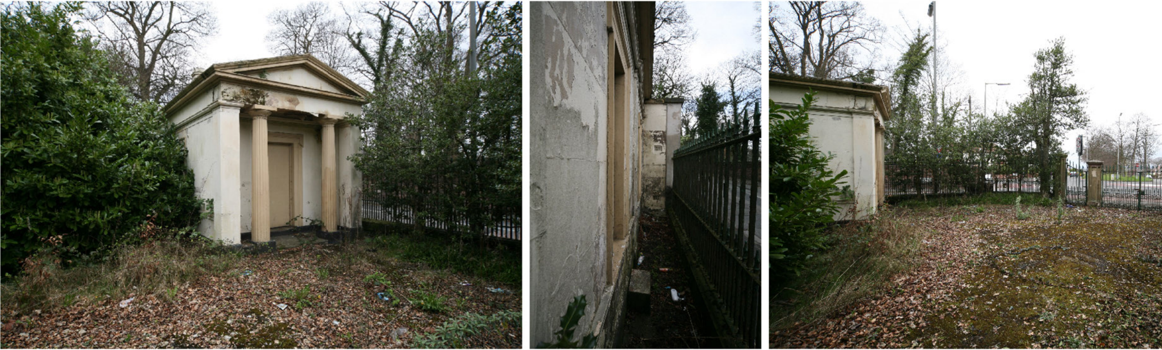
Photographs of existing Greek Lodge