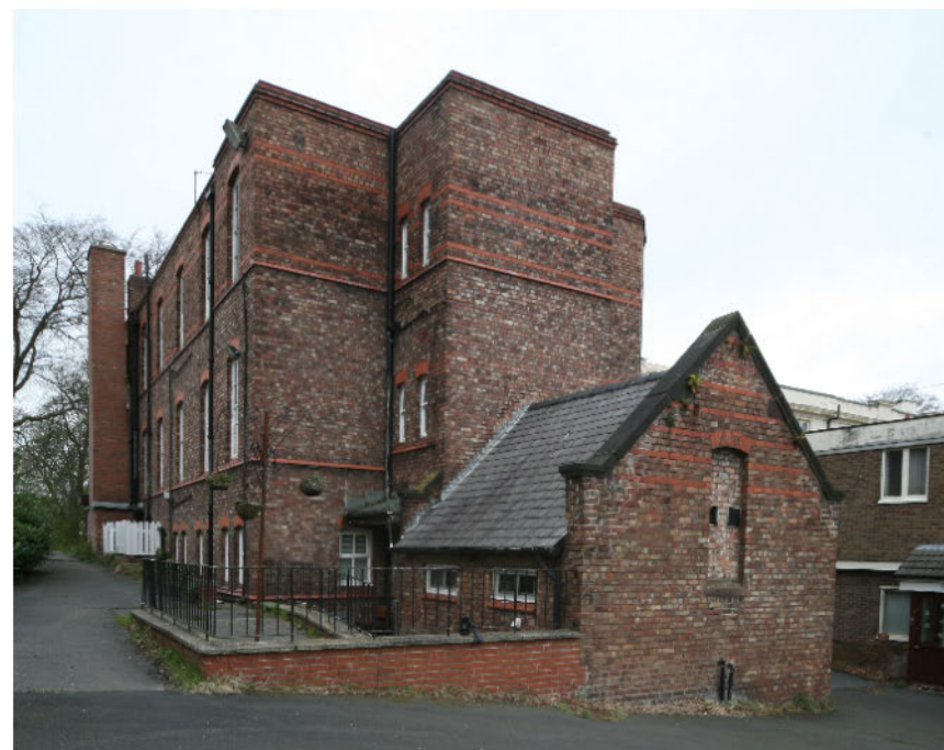
Photographs of German Wing, link corridors and ground floor extensions