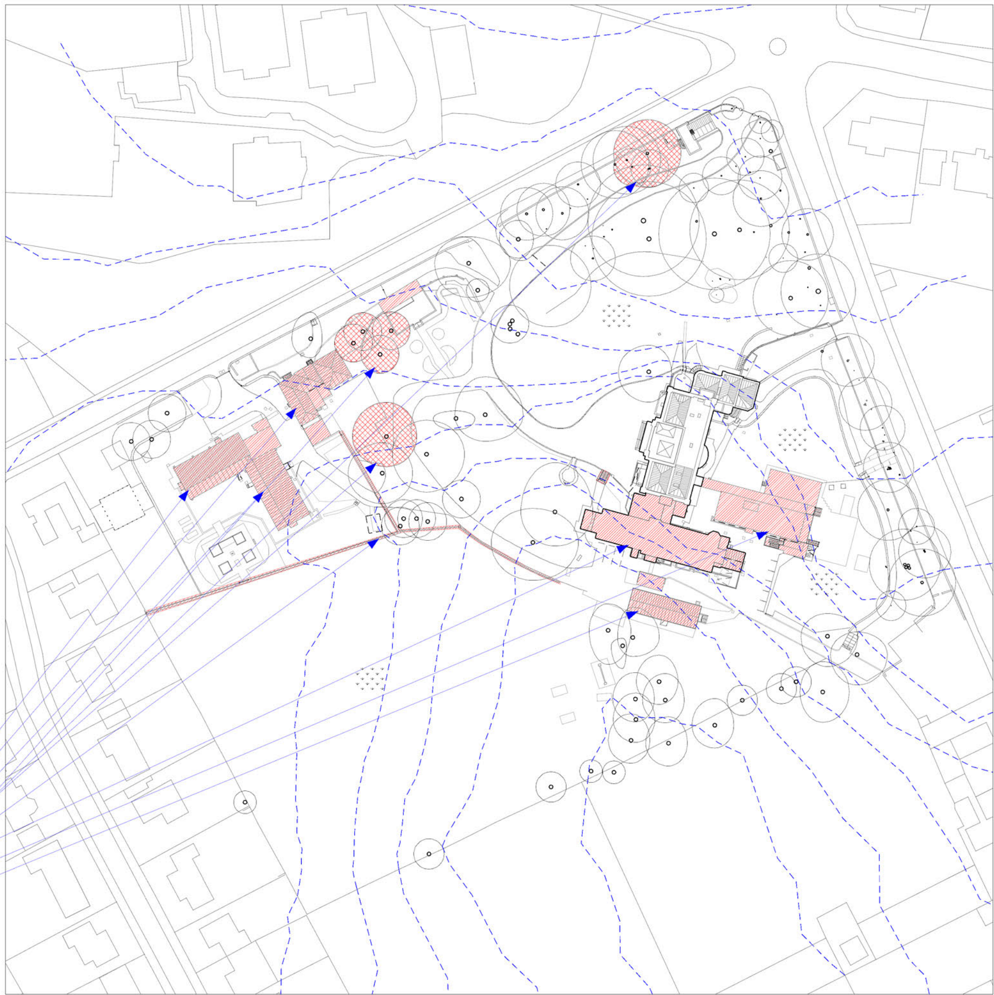
Demolitions Plan (1:1000)