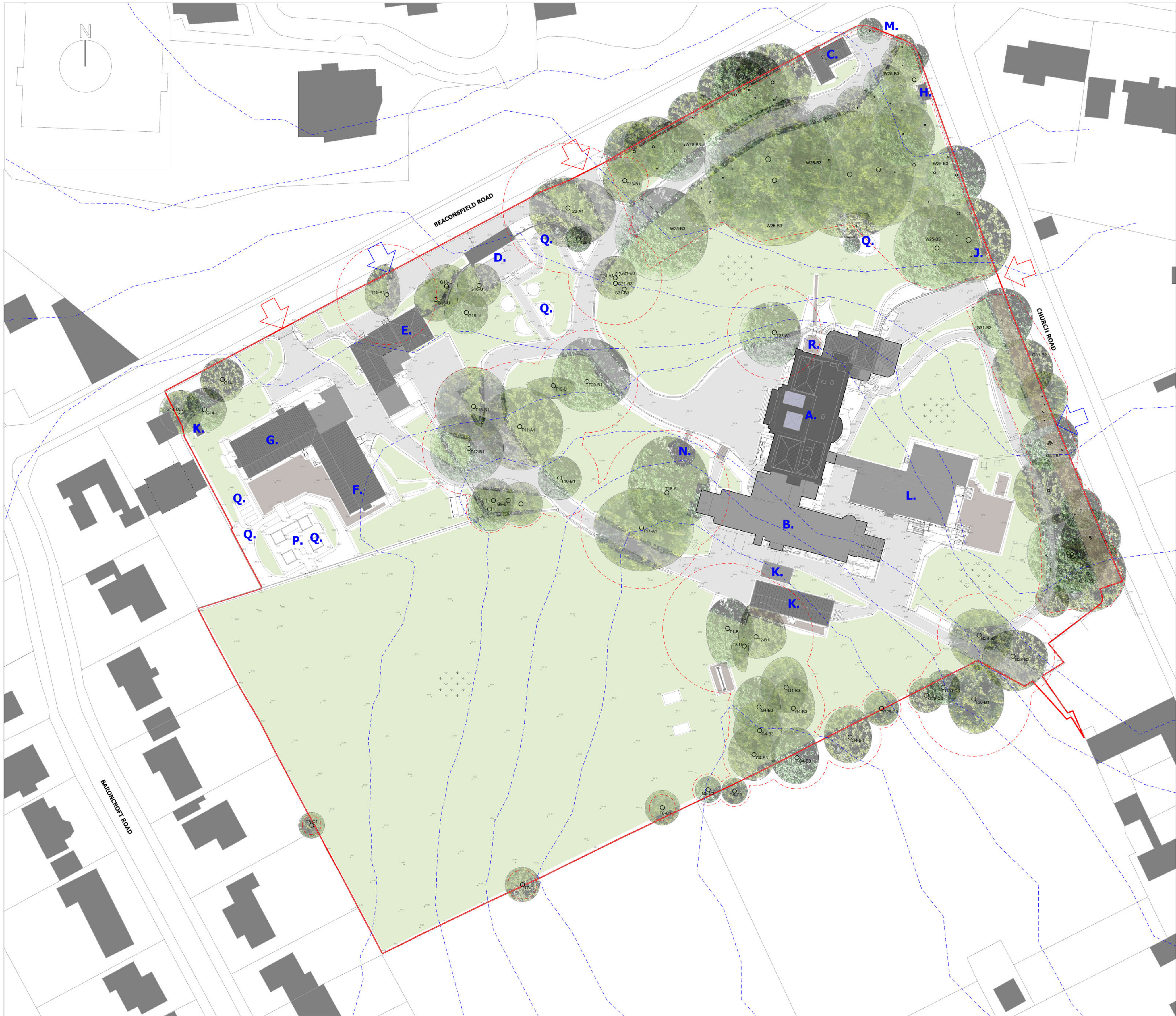
Existing Site Plan (1:500)