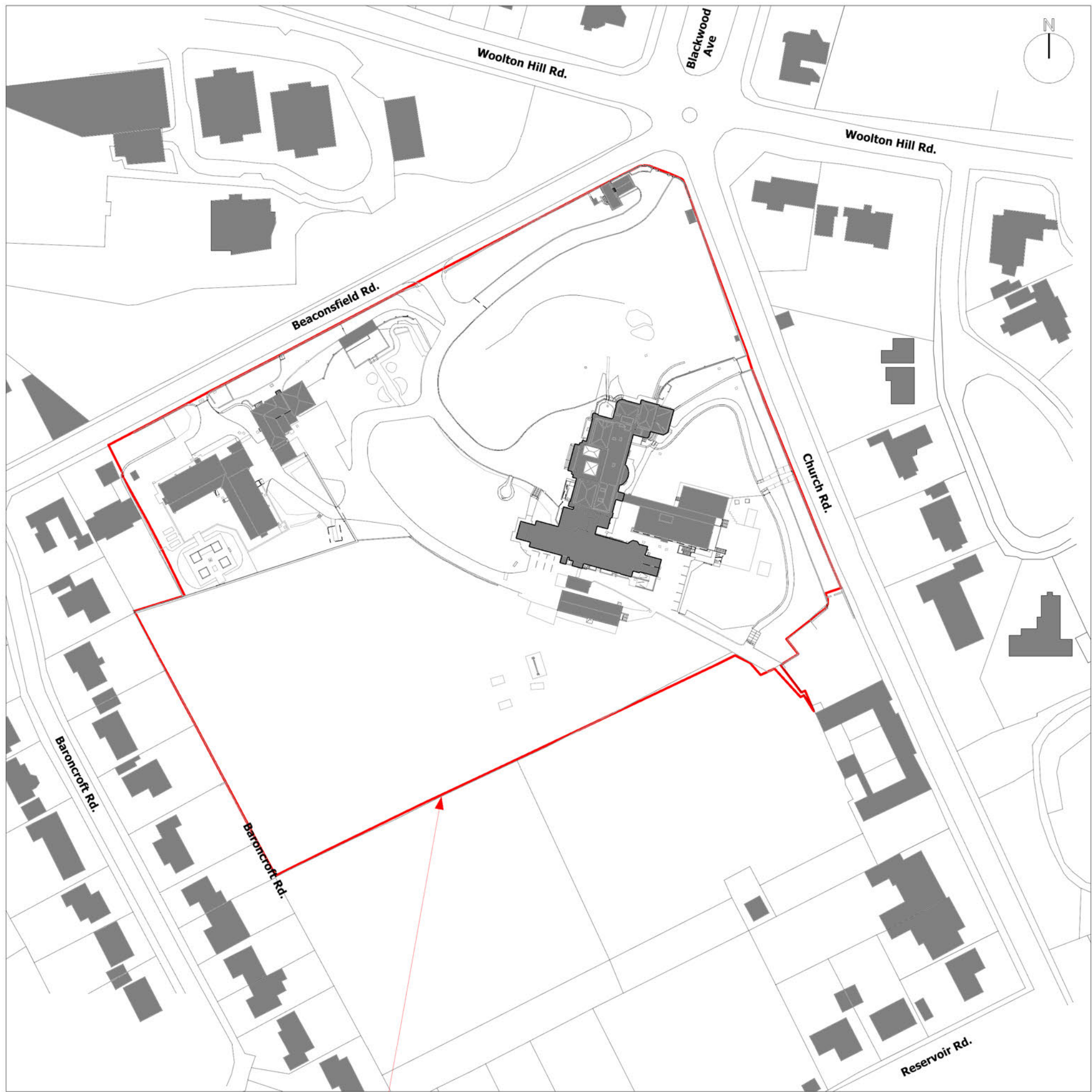
Location Plan (1:1250)

refer to arboricultural report for tree removals and Landscape Architect report for replacement trees Nugent House Gardeners Cottage and garage Taylor House low walls to be removed German Wing and link corridors Nursery Building garages