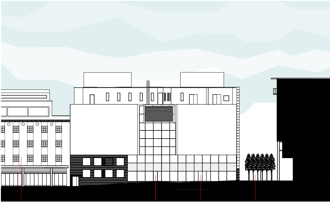
FLEET STREET (REAR) ELEVATION 1:500