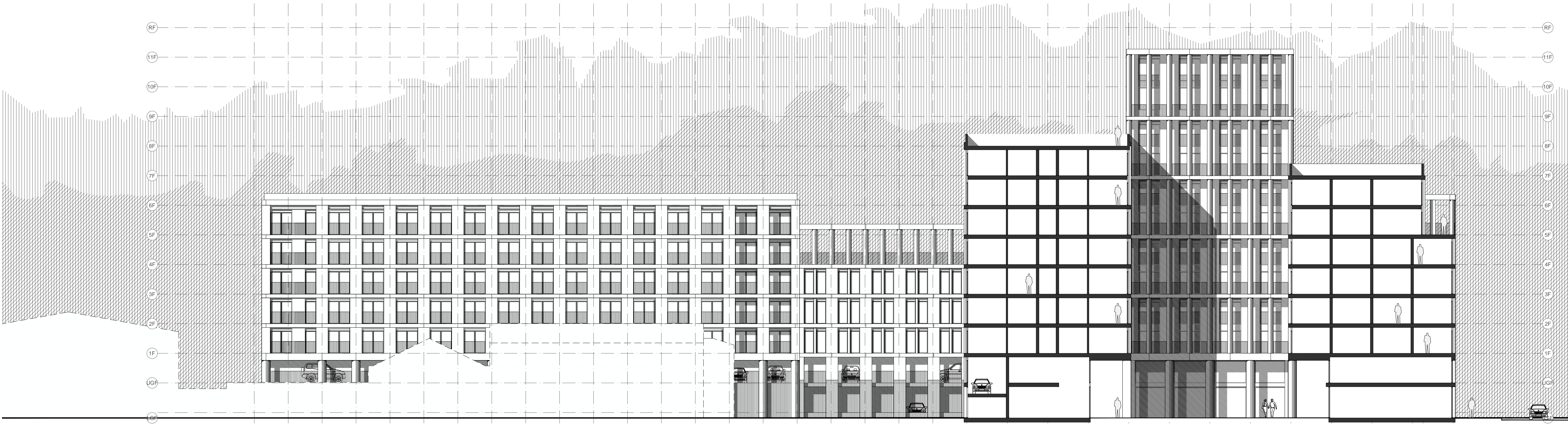
PROPOSED SECTION E-E @ 1:200